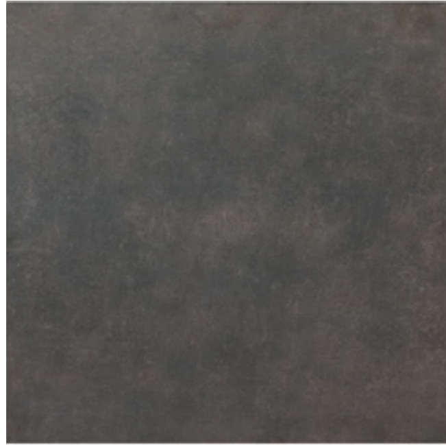
60x60 ETRUSCA Black